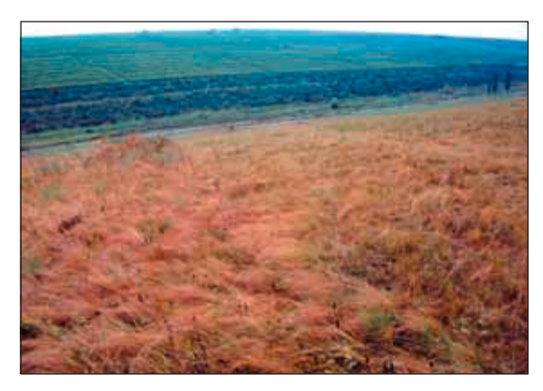
Fig. 1. "Valea lui David" Natural Reserve.

pedo, the eastern subspecies of the sand lizard, Lacerta agilis chersonensis, or endemic and rare species like the moth Evergestis dilutalis or the orthopteran Callimenus (= Bradyporus) macrogaster.