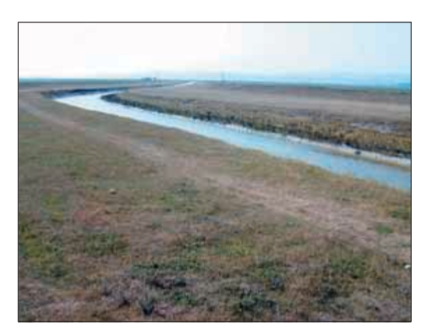
Fig. 7. Unsuitable habitat at Tomești.