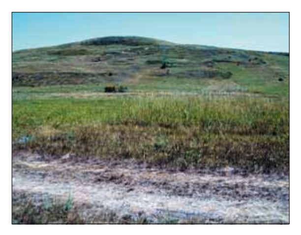
Fig. 4. Newly discovered locality, "Holm" or "Lanu Mare," at Româneşti – Avântul – Ursoaia.

the windy and rainy weather, an additional living adult female was also found on a hill named "Holm," or "Lanu Mare" on the map (Fig. 4). The distance between the two specimens was 890 m. The morphometric data of these specimens can be found in Table 1.