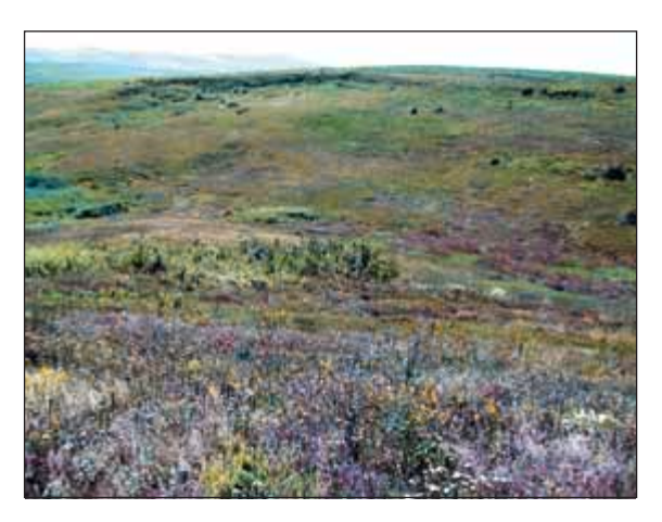
Fig. 6. Newly discovered locality, "Ciritei," at Românești – Avântul – Ursoaia.

In addition, they are manually mowed just like the "Valea lui David" Natural Reserve.