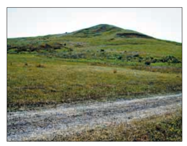
Fig. 3. Locality "Dealul lui Dumnezeu," at Românești – Avântul – Ursoaia.