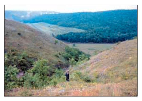
Fig. 9. Locality Trebujeni, where V. renardi specimens have been introduced.

Only a few specimens were known from the Republic of Moldova (Brauner, 1903; 1907; Călinescu, 1931; Băcescu, 1937; Didusenko, 1966; Tofan, 1965; Bannikov et al., 1977; Yangolenko, 1977; Popa and Tofan, 1982; Turcanu, 1993; Borkin et al., 1997) col-