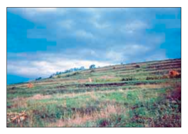
Fig. 2. Erroneous locality, "Dealul lui Dumnezeu," at Larga Jijia.

The first survey interested in V. u. moldavica was made in 1951 – 1952 by Vancea and Ionescu (1954). Later, in 1988, Nilson et al. (1993) visited this population and revised its taxonomy, raising it to the subspecific status V. u. moldavica. In the following nine years no herpetological surveys were conducted in the area. In 1997 (August 25 - 26) one of the authors (ZK) together with Beáta Újvári visited here and captured two specimens. Their morphological data are summarized in Table 1. Subsequently the other two authors (LK, $Z) captured, measured, marked and released 45 specimens in the area, having 3 recaptures. The morphological characteristics of some of these snakes were discussed in Krecsák and Zamfirescu (2001). The population size was estimated to 103 \pm 101 individuals. It should also be mentioned that in 2000 8 specimens were captured in the buffer zone of the Reserve, which indicates the necessity of the extension of the Reserve's area. The reserve is manually mowed, but unfortunately at the end of August. Nonetheless, no dead specimens were found after the mowing. Possible threats for the vipers include: a) human disturbance — the Reserve was enclosed in the 1970s, but today just a few fence poles remain; b) grazing — although it is a Reserve the shepherds sometime bring sheep from the buffer zone into the Reserve; c) pollution — the Reserve lies 1 km from the large Iaşi Medicine Factory "Antibiotica"; d) expansion of the surrounding agricultural fields.