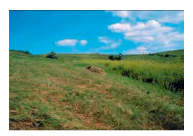
Fig. 8. Unsuitable habitat between Ciucur Mingir and Bucean.

Vancea et al. (1985) discovered V. u. moldavica in Botoşani District, at Călăraşi and Horlăceni close to Şendriceni-Dorohoi. A single specimen collected at Călăraşi on April 21, 1971 remains in the collection of MINJ. The Nature Protection Agency of Botoşani informed us that the two habitats are unsuitable for a population of vipers and most probable they already disappeared from these localities.